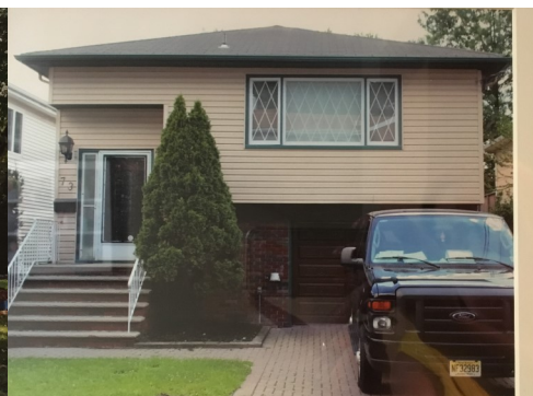
SECAUCUS GROUP HOME