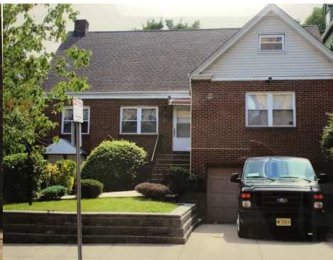
Jersey City Group Home