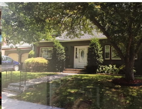
KEARNY GROUP HOME