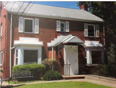
Kearny Group Home