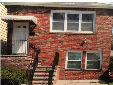
NORTH BERGEN GROUP HOME

Contact us today to get started at 201-434-7783 or email HUDSON.MILESTONES@HUDSONMILESTONES.ORG